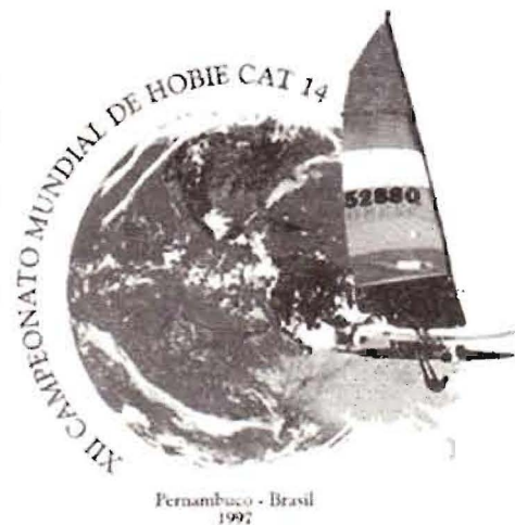
50 Hobie 14's line up for the World Championship in Recife, Brazil