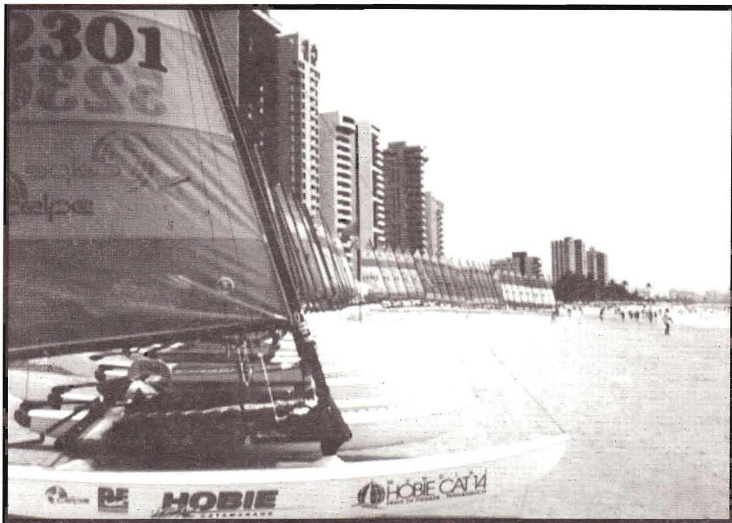
50 Hobie 14's ready for the 1997 World Championship held in Recife, Pernambuco, Brazil

THE OFFICIAL PUBLICATION OF THE NORTH AMERICAN HOBIE CLASS ASSOCIATION