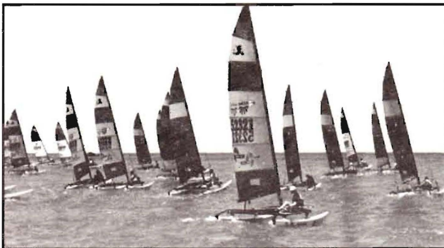
Start of Hobie 14's in the World Championship held in Recife, PE, Brazil in September, 1997.