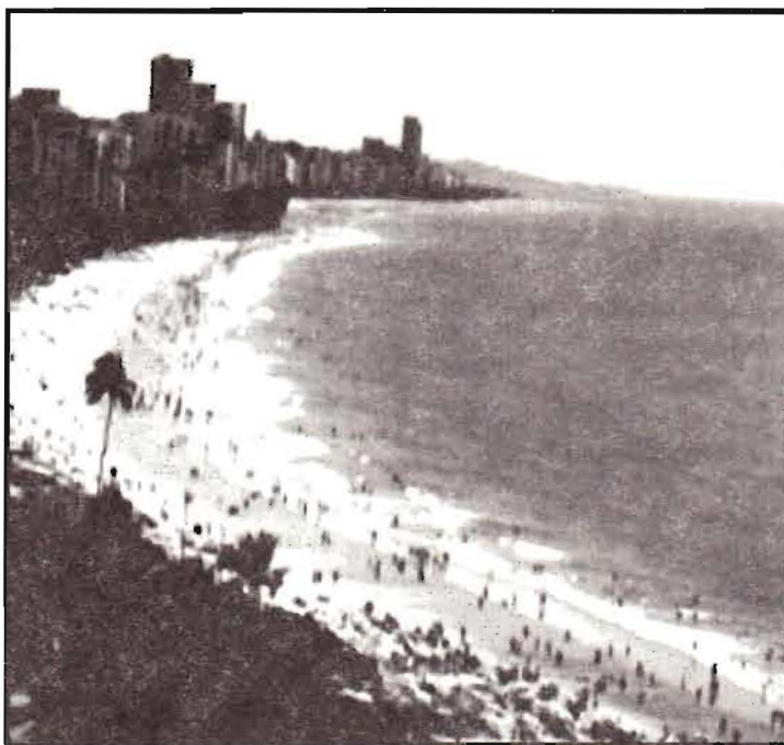
Beach in Recife, Brazil, site of 1997 Hobie 14 World Championship.