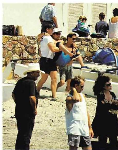
FUN AND TENSION COMBINE AS SAILORS AND SPECTATORS PREPARE FOR THE RACE.